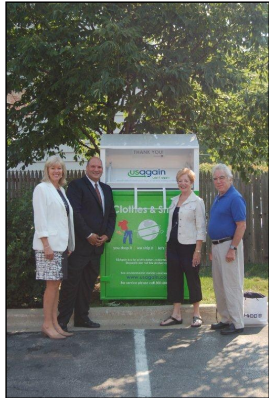
Photo of the dedication of the West Deerfield partnership with USAgain

The EPA estimates that Americans throw away 11.2 million tons of textiles annually, which is 5.3 percent of total municipal solid waste (MSW) generation. This is evidence of a greater need for corporate-government collaboration in the recycling industry. USAgain has a strong national presence, and is well positioned to drive the growth of such collaboration across state lines by sharing best practices. For more information on USAgain, visit www.usagain.com .